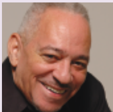
By Rev. Dr. Jeremiah A. Wright, Jr.

Desegregation meant that African American children could no longer be denied the right to go to schools that were “For Whites Only.” Desegregation did not mean that white children would now come to Black schools and learn our story, our history, our heritage, our legacy, our beauty and our strength!